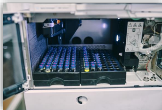
Autosampler on liquid chromatography LC-MS/MS

By permanently investing in employee training and state-of-the-art equipment, we provide all the necessary capacity to meet the requests of customers, during different periods of the year (season of ripening or processing of fruits and vegetables, grains or oilseeds) and in special, emergency cases. The offer related to the determination of pesticide residues may include a recommendation of the scope of the analysis, as well as the possibility of performing a "quick" analysis within 24h or 48h.