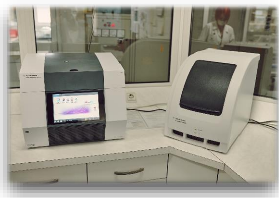
Real Time PCR (PCR technique)